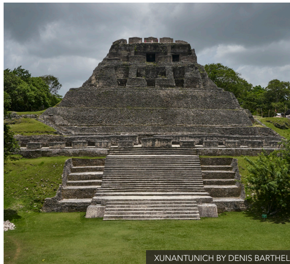
XUNANTUNICH

Transfers to the airport provided by the hotel. (B)