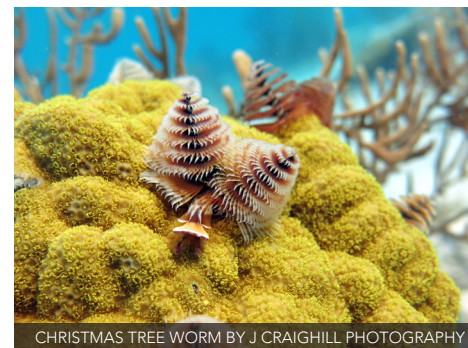
CHRISTMAS TREE WORM