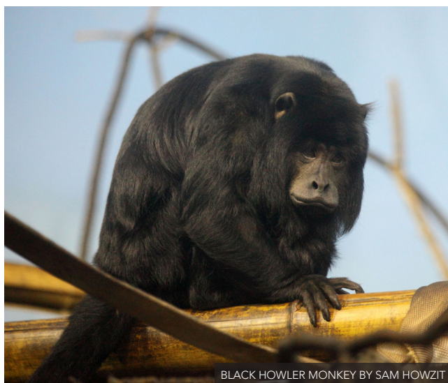
BLACK HOWLER MONKEY BY SAM HOWZIT